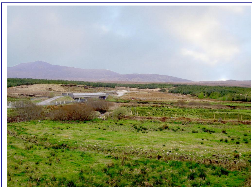
View of Mountains from Front Windows

These particulars are issued by Fox & Gallagher Ltd., on the understanding that any negotiations respecting the properties mentioned are conducted through them. Every care is taken in preparing particulars but the firm do not hold themselves responsible for any inaccuracy in the particulars and the terms of the properties referred to or any expense incurred in visiting same should it prove to be unsuitable or to have been let, sold or withdrawn. Applicants are advised to make an appointment through us before visiting and are respectfully requested to report their opinion after inspection.