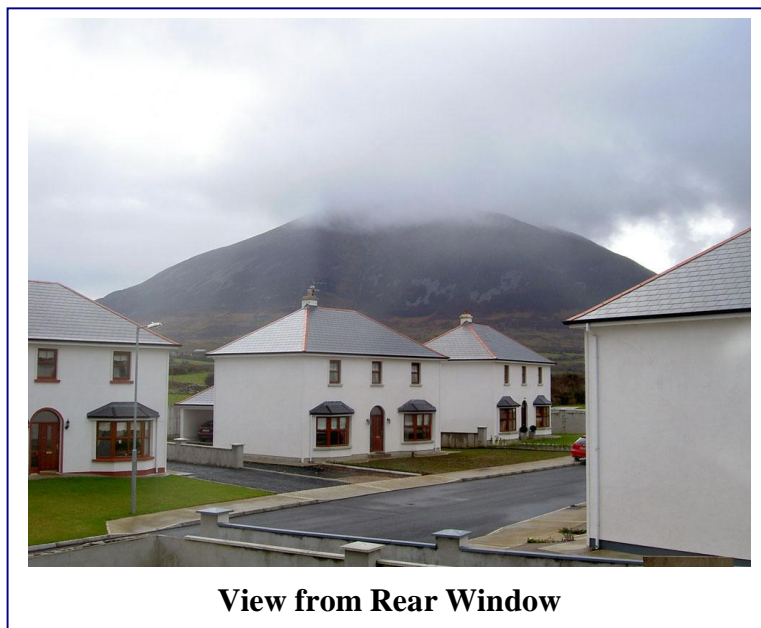
View from Rear Window

These particulars are issued by Fox & Gallagher Ltd., on the understanding that any negotiations respecting the properties mentioned are conducted through them. Every care is taken in preparing particulars but the firm do not hold themselves responsible for any inaccuracy in the particulars and the terms of the properties referred to or any expense incurred in visiting same should it prove to be unsuitable or to have been let, sold or withdrawn. Applicants are advised to make an appointment through us before visiting and are respectfully requested to report their opinion after inspection.